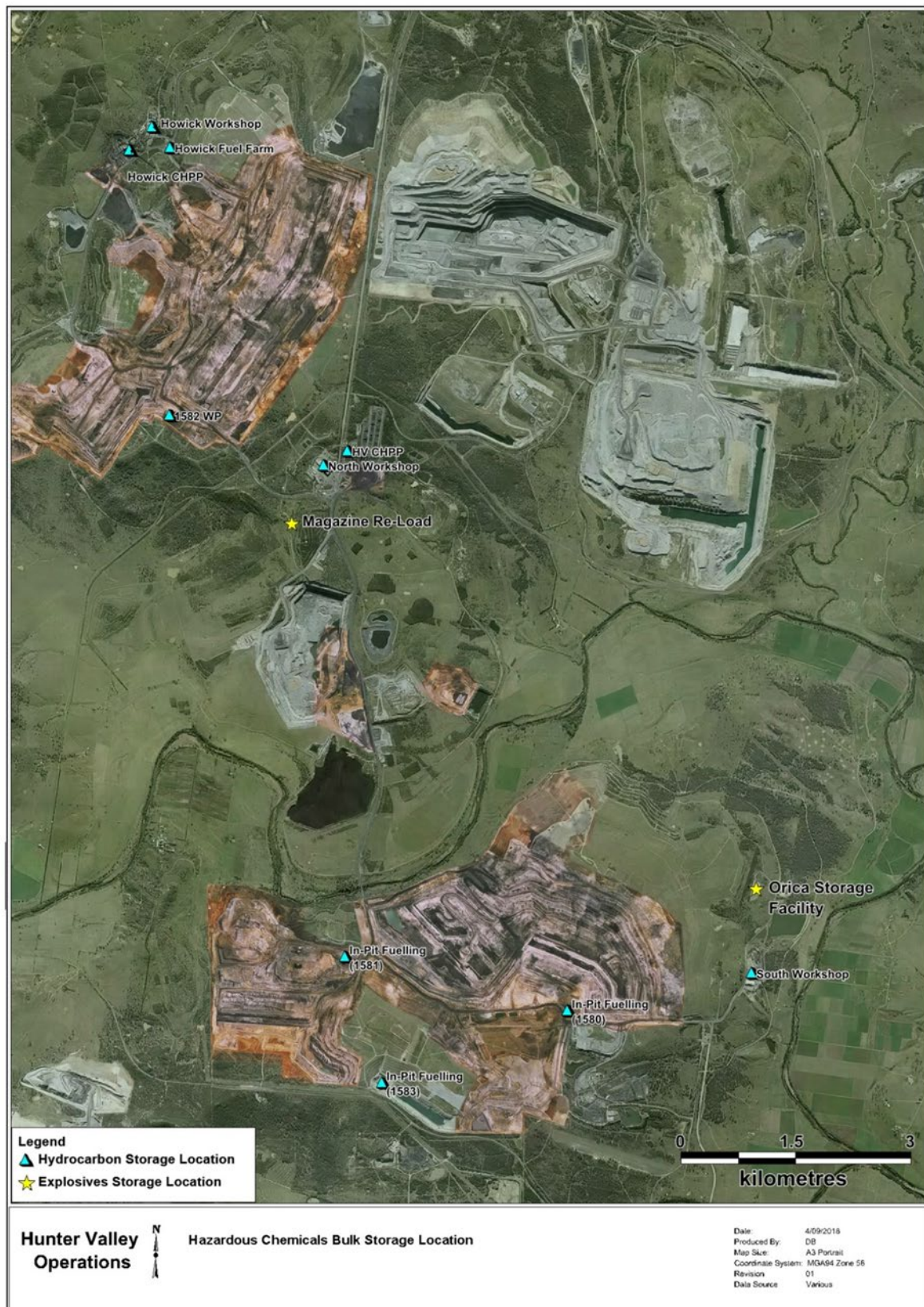
Figure 3 - Hazardous Chemicals Bulk Storage Location